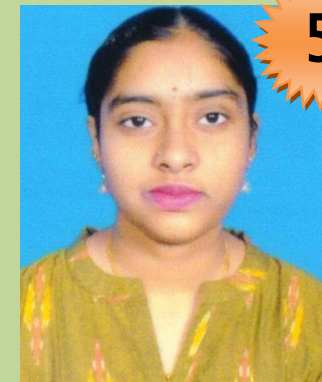
V P BHINKRITA I ESPPy (98.83%)