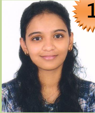
SUCHETA C S I ESPPy (99.83%)