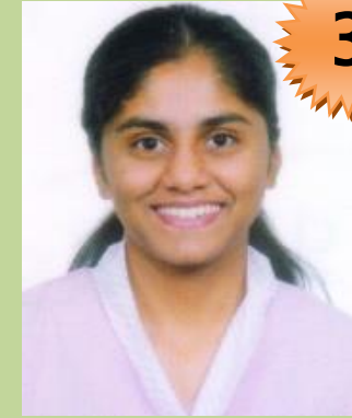
RISHITA N I HEPyS (99.33%)