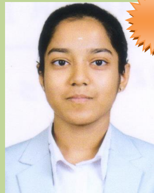
SADHNA D I ESPPy (98.83%)