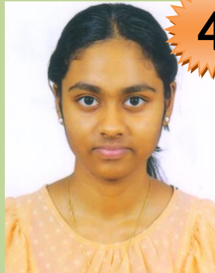
JEMIMA I PCMB (98.00%)