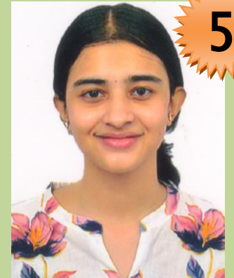
DHIPHTHA B I PCMB (97.83%)